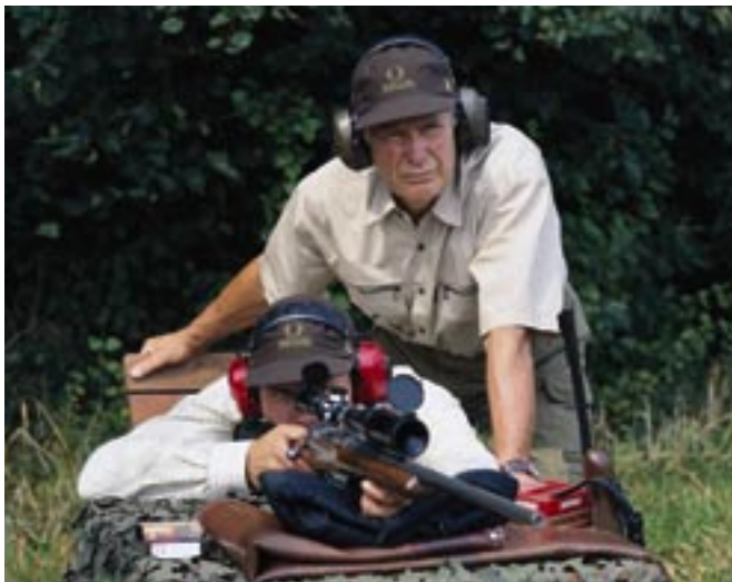
Peltor's active hearing protectors are indispensable tools for instructors and range captains in clubs and competitions.