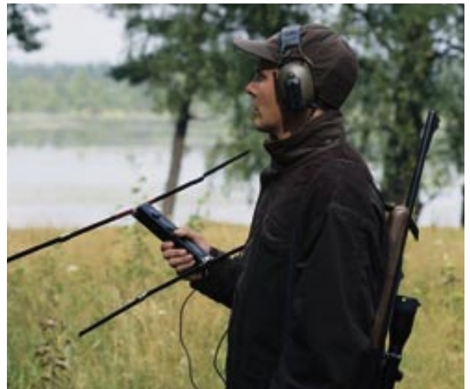
Peltor's active hearing protectors have advanced electronics that amplify weak sounds and attenuate loud ones. This means that you can hear and localise your dog and your game better, while protecting your ears from the noise of the shot. They are also equipped with an audio input for connecting a communication radio or a receiver for a dog-tracking device.

On some models, you can even balance the stereo amplification for your individual needs – for example, to compensate for hearing loss in one ear.